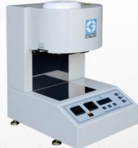
Melt Index Machine