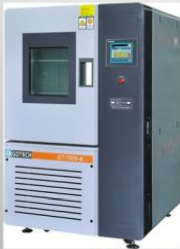
Programmable Temperature & Humidity Tester